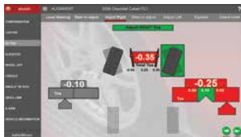
One-click away design for expert information at your fingertips, with advanced graphic displays optimized for visibility and clarity.