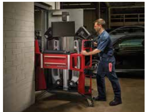
Folding beams, small footprint and casters let your team move the V3300 around the shop as required.