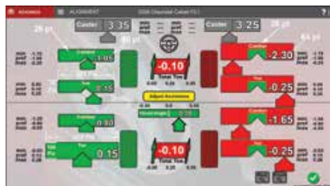
Ground-breaking user interface for instant access to critical tasks, with intelligent predictive alignment flow to provide only the steps you need.