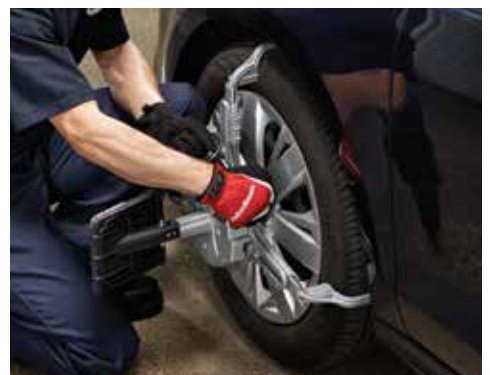
AC400 wheel clamps securely attach to tires without touching the rim; clutch-limited clamping force ensures secure and consistent attachment.

Critical error leading to a bad alignment is detected; user notified that corrective action is required