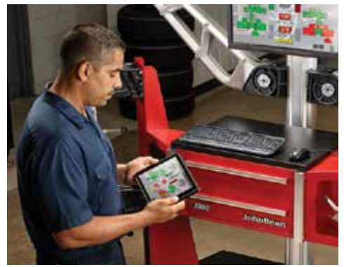
Wireless communication provides control of the unit from anywhere in the shop.